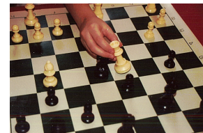
DO YOU PLAY CHESS?

THESE HIGHLY ACCLAIMED CHESS CLASSES FOR CHILDREN ARE HELD IN OVER 50 SCHOOLS ACROSS LONG ISLAND EACH YEAR, WITH OVER 2,000 CHILDREN REAOING THE BENEFITS!